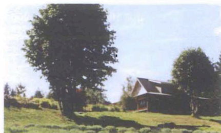
Frog Rock Lavender

Tucked away on the north end of Bainbridge Island, near scenic Port Madison, Frog Rock offers a delightfully unique setting for a special meeting or