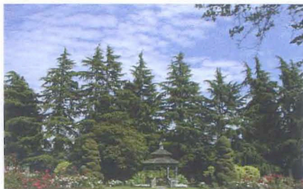
Woodland Park Zoo

Contact: Stephanie Brindley, 206.233.7272