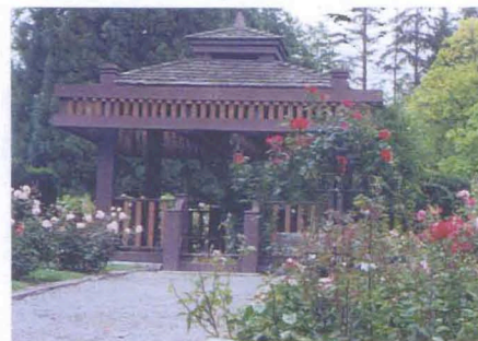
Point Defiance Park & Gardens

With its acres of woodland and lush lawns sprawling between flower beds and lofty trees, the venerable park is a Tacoma favorite. Puget Sound wraps itself around the shores below Point Defiance, while Mount Rainier stands watch over the city and harbor in the background. The adjoining Point Defiance Zoo and Aquarium make for a delightful before-or-after field trip.