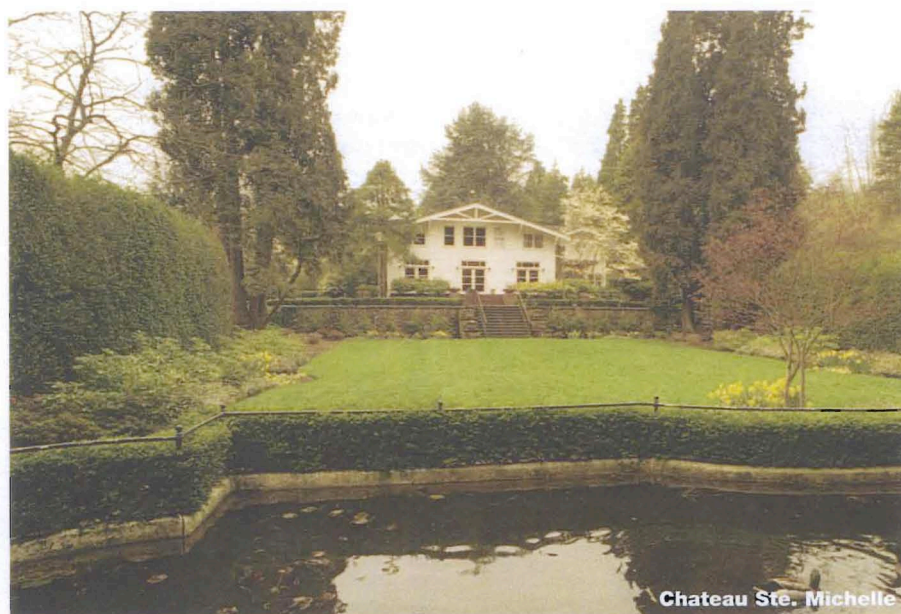
Chateau Ste. Michelle

The Manor House on the grounds features a generous front porch for cocktails, and meticulous lawns where 100-150 guests can enjoy a sit-down affair (tenting permitted). On the estate's concert venue, a stage offers a perfect speaker's platform and the sweeping grassy area can accommodate up to 500 guests. This site can be rented and tented on off-concert days/evenings. The on-site staff caters all events.