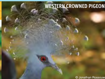
WESTERN CROWNED PIGEON