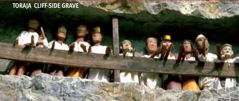
TORAJA CLIFF-SIDE GRAVE

In the afternoon enjoy snorkeling or diving over the undersea spectacle off the lovely