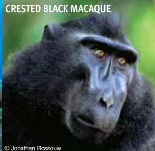
CRESTED BLACK MACAQUE