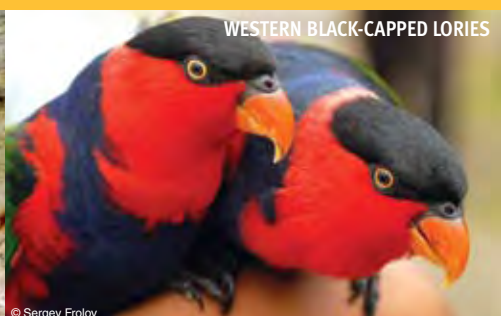
WESTERN BLACK-CAPPED LORIES